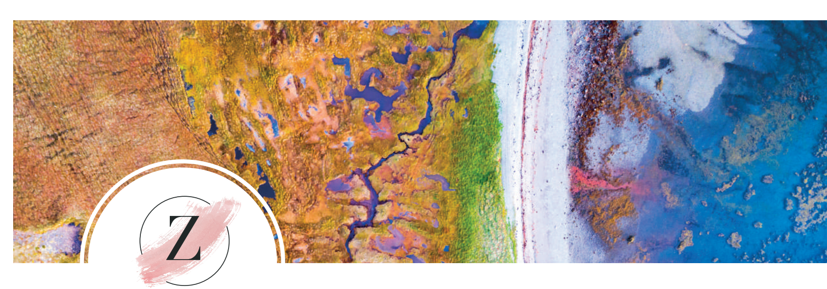
Zevin Asset Management